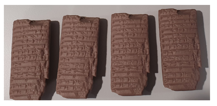
Figure 5: True-size 3D prints of the cuneiform tablet, https://virtualcuneiform.org/tellohModels.html

international cuneiform database. The tablet shown in these interface examples and in the physical truesize prints (Figure 5) was inscribed over 4,000 years ago in the 'Old Akkadian' period: the period circa 2340-2200 BCE. The tablet's digital record can be found in the CDLI with the ID P215518. Inscribed on front (obverse) and back (reverse) as well as along one side, the writing on this tablet tells us that the King's entourage will need to take lentils, chickpeas, barley, milk, cheese, cumin, dates, raisins, figs and more (Cripps 2016).