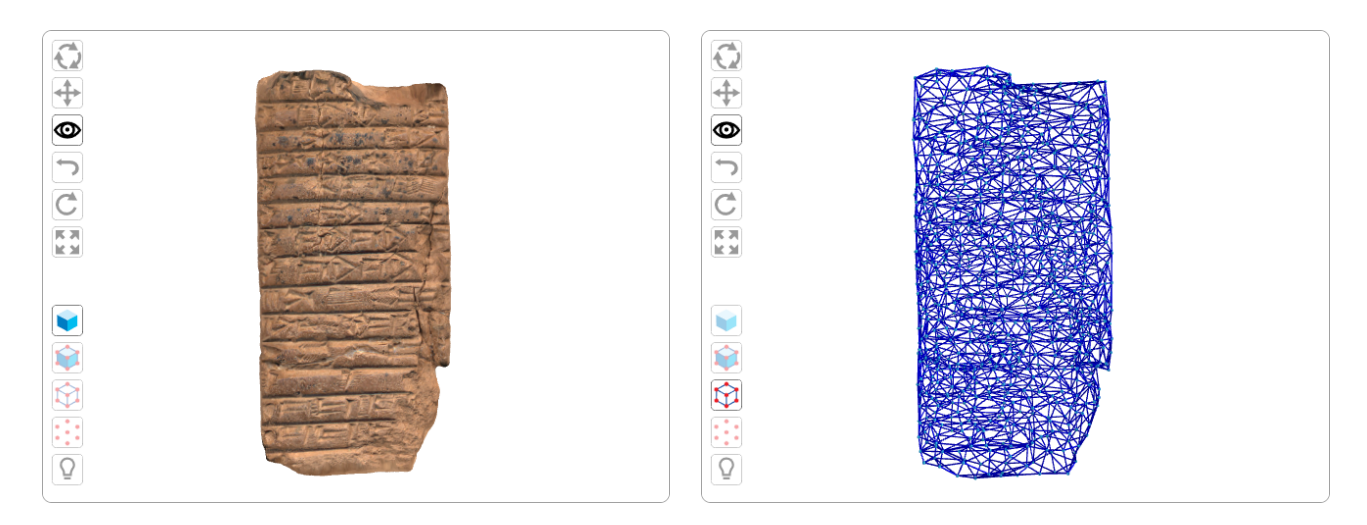
Figure 3: An alternative educational version of the VCTR interface showing (left) photo-realistic rendering and (right) a down-sampled wireframe model.<sup>**</sup>